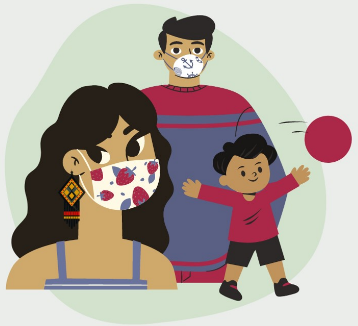
Youth & Children